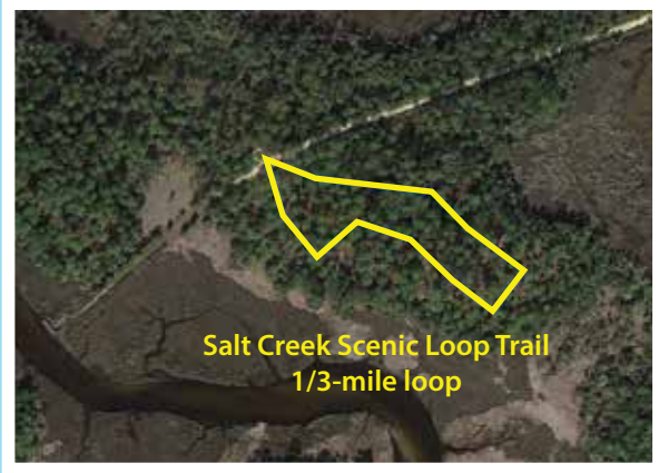
Salt Creek Scenic Loop Trail 1/3-mile loop

Caution: Be aware that this is a wildlife refuge and while on this trail, you might encounter alligators or snakes. Ticks are common in tall-grass areas and poison ivy vines grow on many trees along the trail.