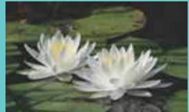
Water lilies blooming along the Mainline

Walking the loop counter-clockwise you pass several salt marshes including a sign-marked vista of the village of Suwannee. Farther on are several stately live oak trees and a marsh pond before you return to the parking area. Be sure to walk around the yellow Refuge gate to visit the Salt Creek fishing/observation platform. Bald eagles sometimes nest on the islands across the creek.