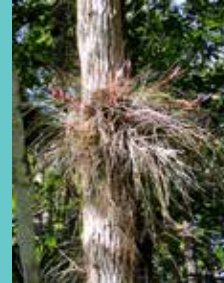
The southern needleleaf is an epiphytic flowering bromeliad.

Mysterious and still, swamps along the Mainline can be recognized by their standing dark water with cypress trees and knees rising for air. Look for several types of air plants or epiphytes, such as Spanish moss and southern needleleaf. Epiphytes grow harmlessly on another plant, drawing moisture and nutrients only from the air, rain and sometimes the debris around the plant. Barred owls are year-round residents often living in swamps and bottomland areas. Occasionally, you will see them in daytime.