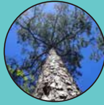
Towering pines dot this 1.3-mile (one-way) trail

Notice the papery bark scales of the longleaf pine. Their thick bark protects the tree from surface fires during controlled burns. Insects and amphibians seek refuge in the leafy bark which in turn draws hungry birds.