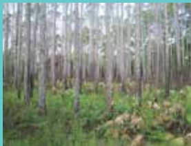
A diverse upland pine habitat in the Refuge

Slash pine covers most of the upland areas along the Mainline. Many of these stands have been thinned and burned to increase growth and quality; fewer trees, less competition for space and nutrients. This also let more sunlight reach the forest floor, spurring growth among plants that offer food and cover for wildlife. Some sites have been replanted in the original longleaf pine.